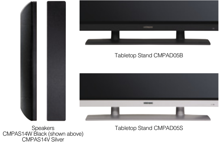
Speakers CMPAS14W Black (shown above) CMPAS14V Silver